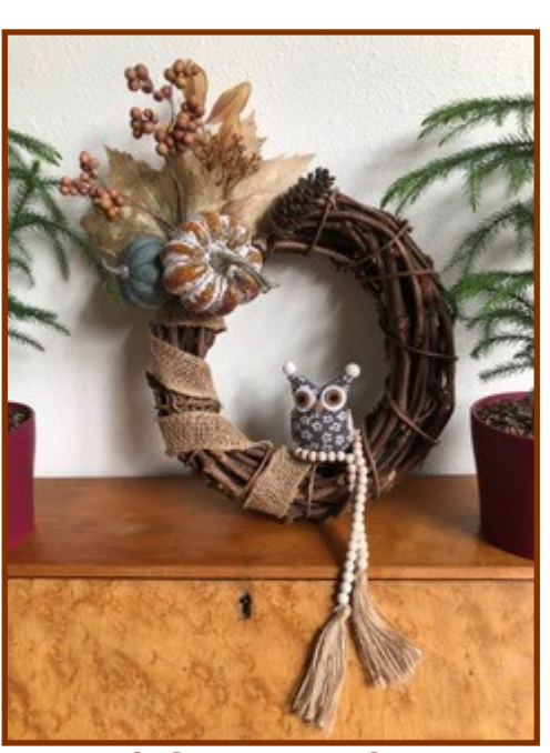
Wreath for Door Prize