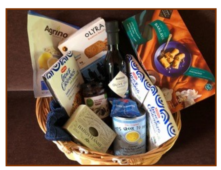
Greek Basket for Raffle